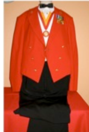
EVENING DRESS JACKET TROUSERS BLACK TUX OR TROUSERS BLACK WITH BLACK DRESS BELT