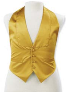
Gold vest front