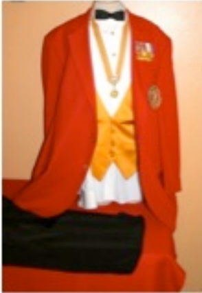
RED BLAZER FORMAL