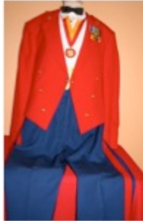
EVENING DRESS JACKET BLUE DRESS TROUSERS WITH RED NCO STRIPE