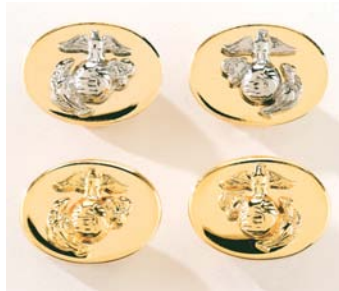
Cuff Links and Shirt Studs