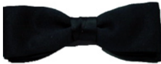
Military bow tie