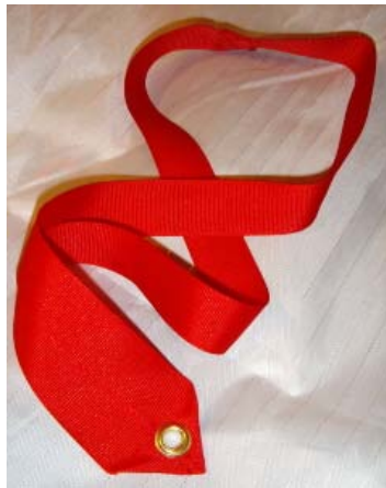
COLLARS Devil Dog